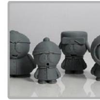
3D maker education