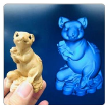
Toys and garage kits